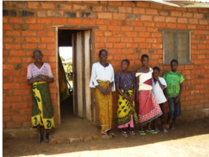
The family with smiling faces for the visiting Tumaini team.