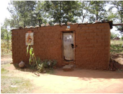
The previous poor home