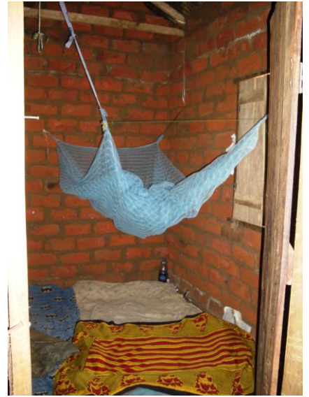
This photo through the open door shows how most families sleep at night... with bedding laid on the floor and the essential mosquito net suspended above