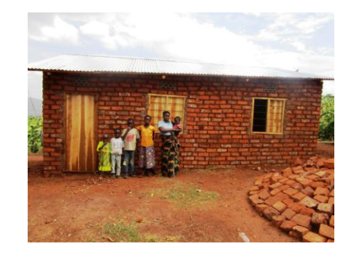
Theonestina and five of her children stand proudly in front of their new 2015 Tumaini built house