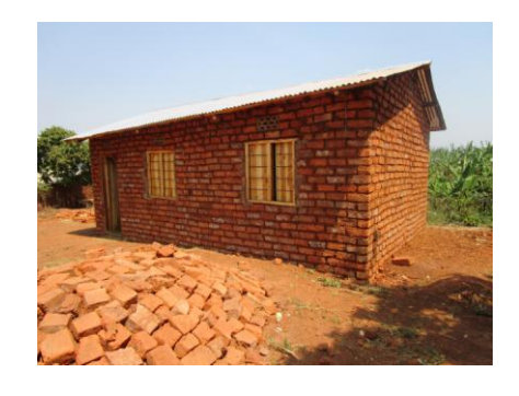
Theonestina's house is a typical Tumaini house built of fired bricks