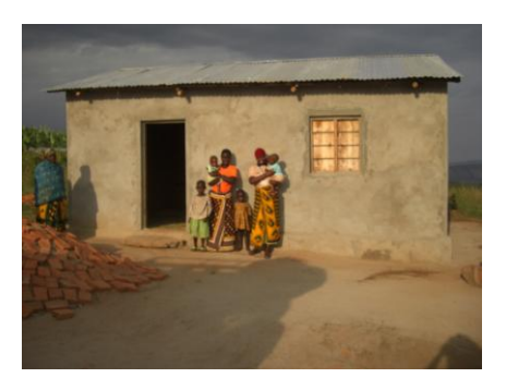
A happy family in front of their new Tumaini built home

A warm, dry bed for each family member to enjoy