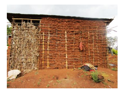
Awful previous house exposed to the rain and wild animals

Theonistina is a widow and head of this family of 6 children. They were living in a terrible house.