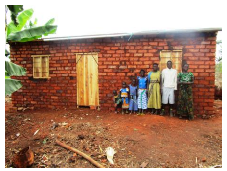
Widow Sedules with her 6 children Proudly showing their new Tumaini built home

In the rainy season, the heavy downpour leaked through the roof and the family simply stood and waited for the rain to cease and the floor to dry before they could lay bedding on the ground to sleep.